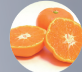
Vitamin C derivatives

Prevents rough skin Well-textured For smooth skin.